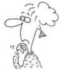
The painting is upside down.